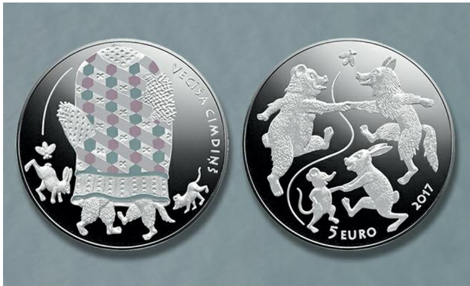
Fairy Tale Coin. The Old Man's Mitten. (2017. Bank of Latvia. Collector coin. Silver.)

All the friends got so frightened that they jumped out of the mitten and ran to escape so vigorously that the mitten bursted. There is no news afterwards about the Fly living in the king's castle, the Mouse feeding in the potato cellar, the Rabbit hiding in the oats, the Wolf resting in the bushes, and the Bear lumbering in the forest. But one thing is certain: up to this day, the old man is walking with only one mitten on.